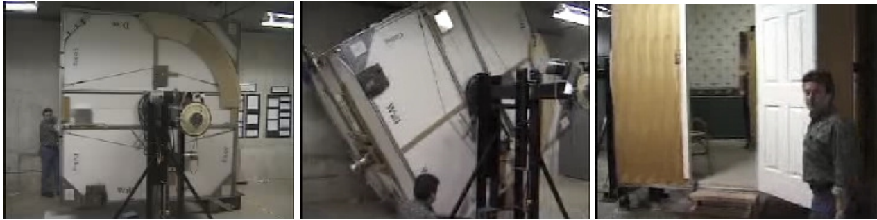
Figure 2. The Tumbling Room. The Tumbling room is an 8' cube mounted on a horizontal axis. The room can be rotated about this axis under computer control. The internal visual structure of the room is highly polarized in terms of its visual cues. Subjects are placed within the room and can either be rotated with the room – so that the visual environment remains visually upright even though the room has been physically rotated, or they can be kept physically upright while the room is rotated about them.

to the user. The VR Trike is a self-sufficient display device, requiring only a tether for power. Subjects 'ride' the Trike which can either be mounted on rollers so that it does not physically move and hence does not generate correct vestibular cues to the rider, or it can be ridden around an open environment and hence can be used to present the rider with the appropriate physical cues to their own motion. The Trike is instrumented so that wheel motion and steering angle are known. The onboard computer (an SGI O2) combines this information with relative head motion sensed by the 6DOF head tracker to present simulated visual displays to the user via a V8 binocular head mounted display.