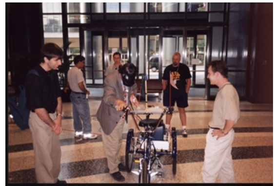
Figure 1: The Virtual Reality Tricycle. The VR Trike permits different combinations of visual and non-visual cues to be presented to an operator, but uses a HMD to generate the visual cues.

Pairing different combinations of visual and physical motions in the real world is very difficult. When we move 'naturally', the various motion cues are presented in association. Breaking this association can be accomplished via standard psychophysical hardware, but often only very limited disassociations are possible. For example, prism glasses can be used to invert the visual world so that the visual world changes with the same magnitude as it would normally change, but with an image inversion.