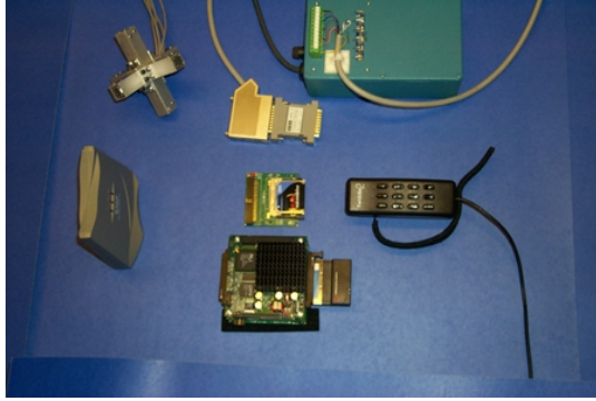
Figure 4. Components of the inertial tracker. The cross-shaped device in the upper left is the inertial tracker. The microprocessor (lower center) is worn by the user, and broadcasts tracking data offboard to the base station (lower left).

To use the VE library, a function must be defined that will generate the geometry for a scene. This function must be thread-safe in that multiple threads must be able to call the function simultaneously. This function should just generate the geometry, it should not load a view or projection matrix.